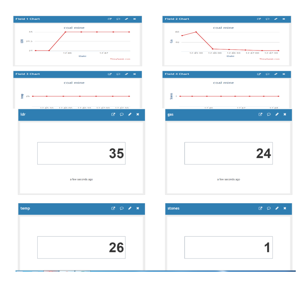
Figure 2 Output screenshots