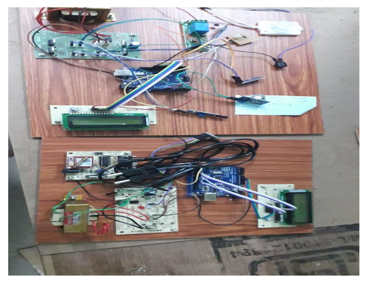
Figure 1 Arduino Setup

The Arduino Development Environment (IDE) includes a word processor for writing code, a message area, a book console, a toolbar with buttons for common functions, and a series of menus. As illustrated in Figure 1, it communicates with Arduino and Genuine equipment to transfer programmes and communicate with them.