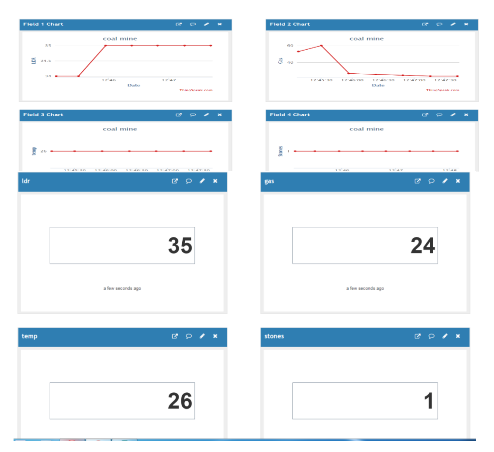
Figure 2 Output screenshots

FIELD-4: It is a vibrator graph. It changes the value 1 to 0 when stones fall in the coal mine.