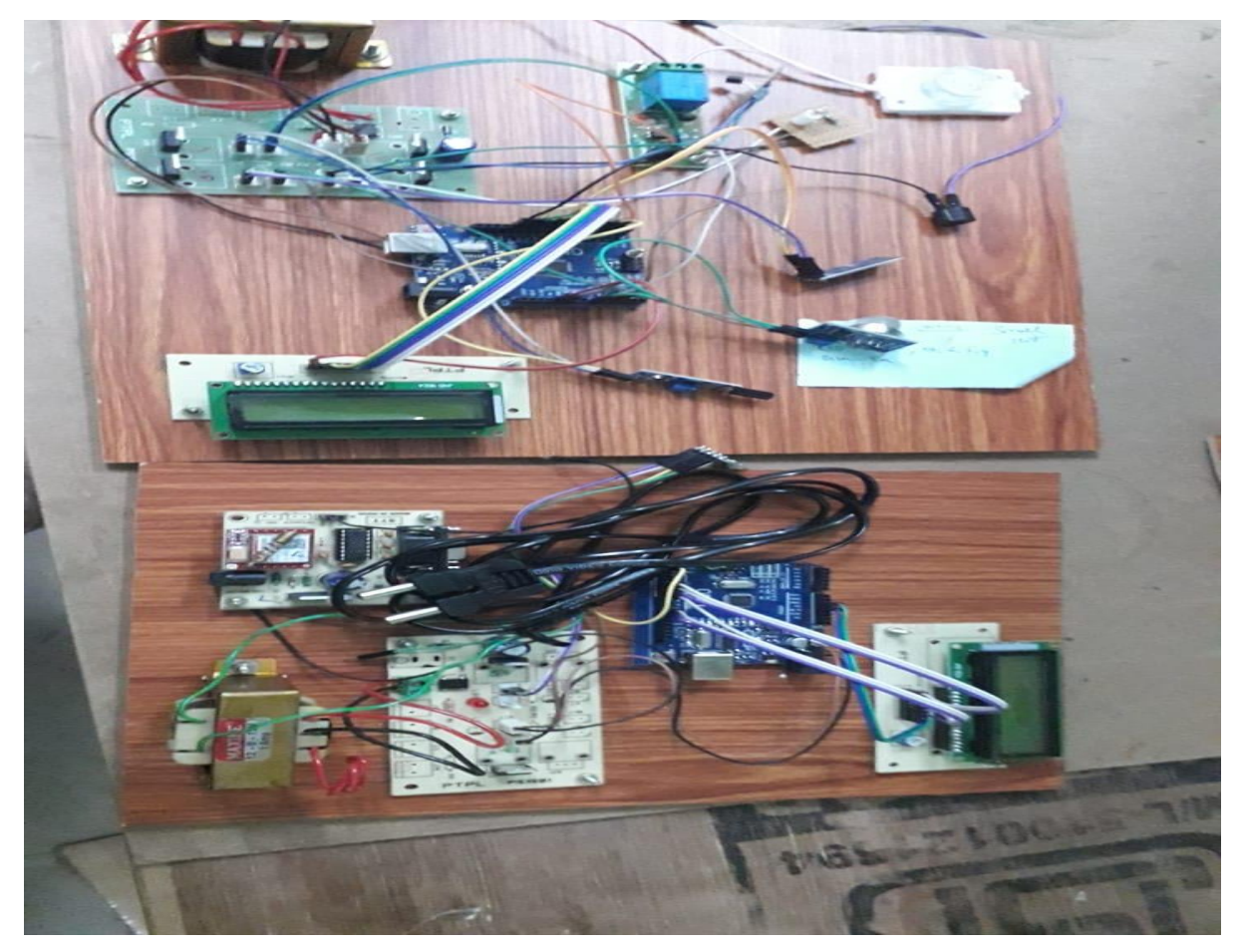
Figure 1 Arduino Setup

The ATmega328 is used in the Arduino Uno board, which is a microcontroller. It has a 16 MHz earthenware resonator, an ICSP header, a USB connection, 6 simple data sources, a force jack, and a reset button, as well as 14 computerised input/yield pins, six of which can be used as PWM yields. It also has a 16 MHz earthenware resonator, an ICSP header, a USB connection, and a reset button. This provides all of the essential assistance for using a microcontroller. To begin, they must be connected to a computer through a USB port, an AC-to-DC converter, or a battery. The Arduino Uno Board differs from the rest of the sheets in that it does not have the FTDI USB-to-chronic driver chip. The Atmega16U2 (Atmega8U2 up to form R2) has been modified as a USB-to-chronic converter and includes it.