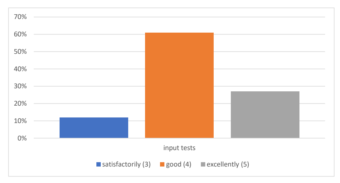
Fig. 2. Test Results After Training

Thus, The Traditional Education System Requires Separation From The Main Job, From The Family, Coming To A Postgraduate Education Institution And Additional Material Costs. Distance Learning Is Delivered In The Workplace, With Most Health Workers Being Trained, And Creating Conditions For Training Nurses From Remote Areas. According To The Literature In Developed Countries, This Teaching Method Has Already Justified Itself, While Reducing The Time And Money Spent By Trainees And Organizers, With The Possibility Of Increasing The Number Of Cycles And The Number Of Participants [5].