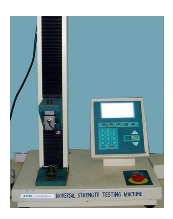
FIGURE 1: Hounsfield Universal Testing Machine