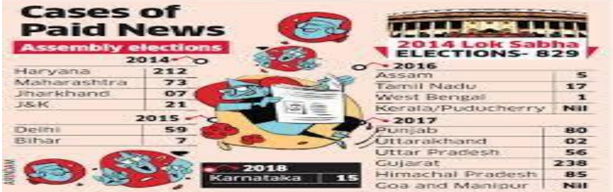
Figure.02 Paid News Cases

Commercialization has promoted and popularized the paid news culture in mass media industry that attempts to present the favourable story before the society in place of real story of the cases being discussed and debated by different media houses across the country. Thus, media takes to show that is paid, not which is unpaid, restricted and challenging. Thus, media is indulged in changing the perception and opinion of the society rather than putting the facts impartially before the society and giving them opportunity to think at their own. This practice is great shock to the credibility of media. Nowadays media is absolutely engaged in propagating government's ideology, stands, decisions, and actions irrespective of their social, economic and political implications. It is very much spectacular during the State Assembly and Parliament elections.