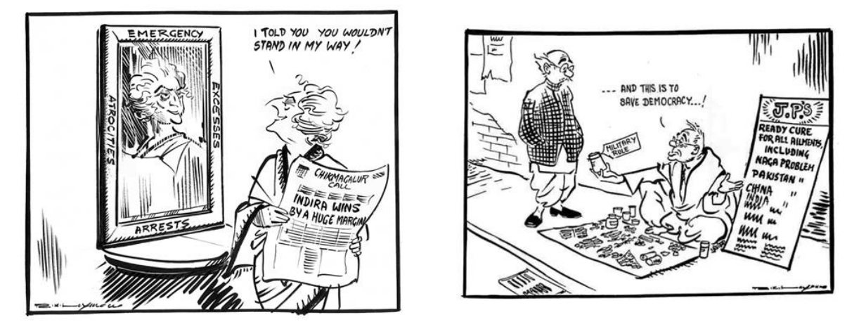
Fig 3. R.K. Laxman, India, 1978.