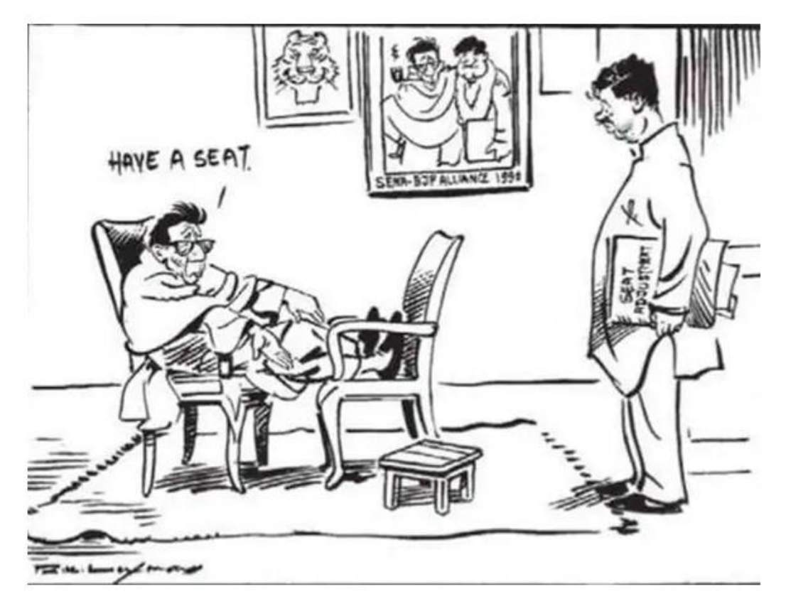
Fig 2. R.K. Laxman, India