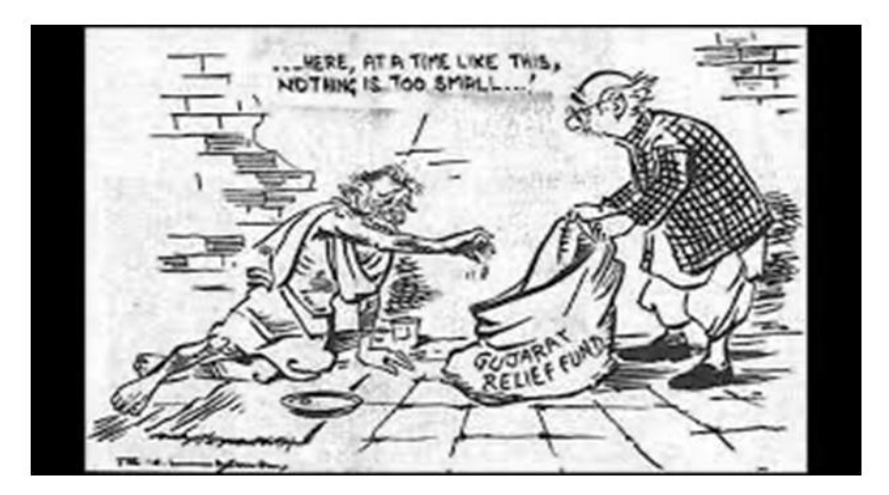
Fig1. R.K. Laxman

In papers political drawings have normally communicates the ability to redirect and cartoon characters or political stories. Like making contorted nose, huge eyes, long ears such outlines made in various styles draw openly, which makes a picture in the personalities of the watchers for long haul. At the same time, political outlines convey peruses with special sort of mental disposing of that lessens social impediment and maintains a strategic distance from the acceleration of battle. Public feel more passionate when they envision themselves in a condition identified with everyday person. Model a popular outline by R.K.Laxman