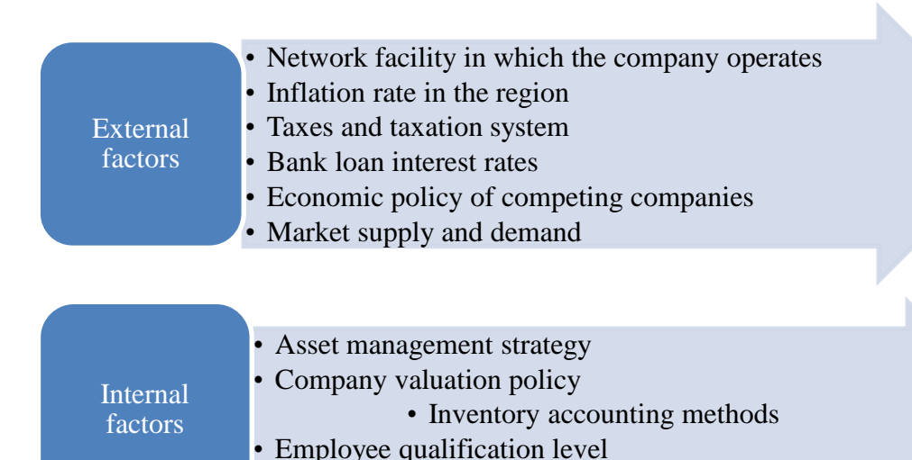
Pic 1. Factors affecting business performance.

Although net profit from product sales, inventory value, accounts receivable and payable were factors that directly affect the business ratio, we can classify external and internal factors as indirect factors (pic 1).