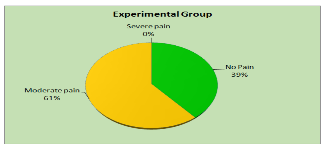
Figure no. 1. Pain Score of experimental group