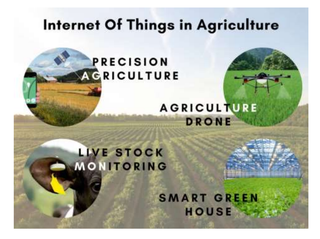
Figure 3. IoT applications in Agriculture

The Internet of Things (IOT) will change the world's way of life. Each feature of conventional agriculture methods can be radically modified by the use of latest wireless sensors and IoT techniques in agricultural domain. To feed the continuous growth of population around the world, it will be better for the agriculture industry to implement IoT techniques in future. For example, the demand for more food production, the farmers should meet the challenges like climate change due to global warming, extreme and various weather conditions and environmental impact due to pollution and other farming practices. Intelligent farming by using IoT technology helps farmers minimise waste and improve productivity. Intelligent agriculture is fundamentally a hi-tech food-producing device that is clean and mass sustainable. Figure 3 illustrates some important applications of IoT for precision agriculture.