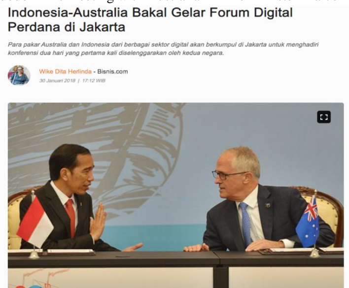
Figure 3. The President Joko Widodo in His Meeting with the Australian Prime Minister Malcom Turnbull in the Signing of the Jakarta Concord at the 2017 Indian Ocean Rim Association (IORA) Summit

In the context of Indonesian, the existence of digital forums in the digital citizenship infrastructure to reinforce national identity is an instrument to contribute for world relations. The following is a figure of President Joko Widodo in his meeting with Australian Prime Minister Malcom Turnbull.