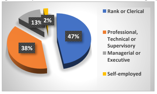
Figure 3. Present Job Level Position

Figure 3 shows the level of position of the graduate respondents. The figure revealed that 47% of the graduates have rank or clerical positions. It is also noted in the figure that 38% of them are professional, technical and supervisory and there were about 2% self-employed graduates.