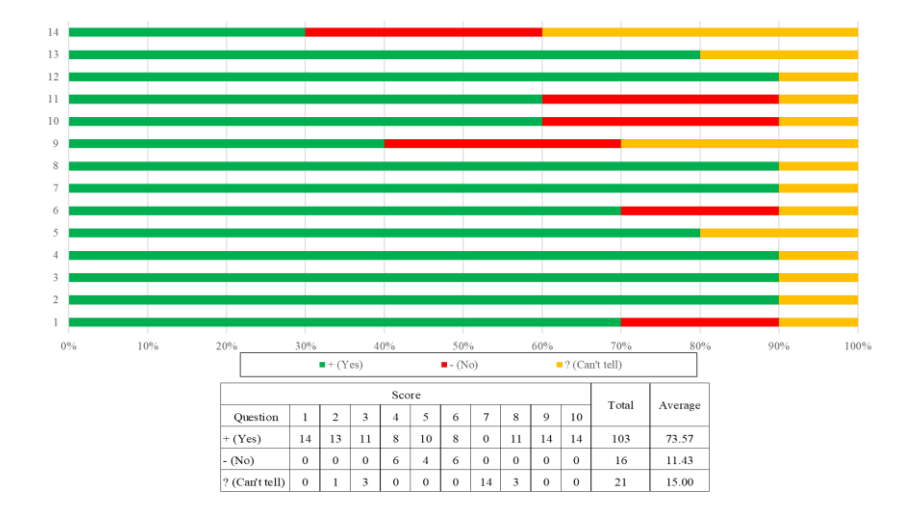
Figure 2. Critical Appraisal Skills Programme result

The Critical Appraisal Skills Programme (CASP)^1 is used as a meta-synthesis method in systematic reviews. This instrument will assess 14 things and then filter them down to 10 questions (Figure 1), with no items being omitted and removal in the process.