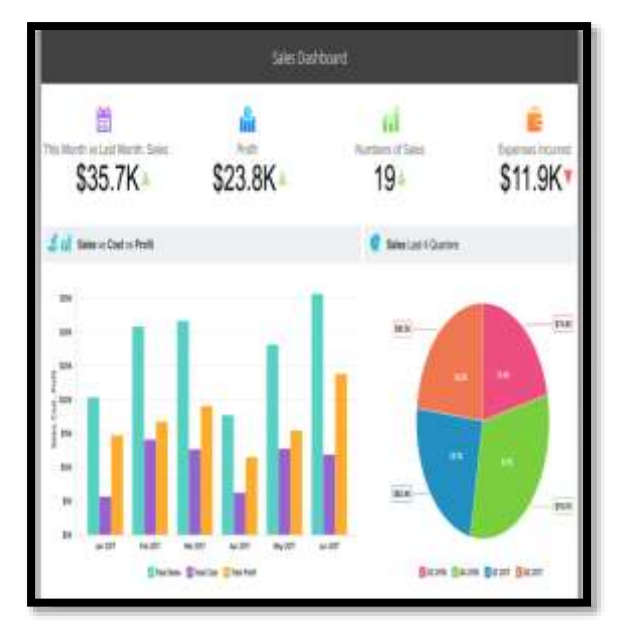
Figure 3: Dashboard sales report

Secondary quantitative and qualitative data analysis methods are used to analyse information of business intelligence, data mining, and decision-making for business enhancement. In this research work, the thematic analysis is used to analyse the information of the business intelligence to influence decision-making. Through making themes, the research work analyses the information of business intelligence. In the data analysis process, the description of business intelligence tools, and the role of business intelligence in the business organisation, impact of it are analysed properly. There are two main themes which are used in the research paper and those are, impact of business intelligence is given and also the decision-making skills are also described. This study uses descriptive analysis and it helps to describe all the small things of business intelligence tools and data mining. Descriptive analysis is the data analysis process where the information of the topic can be reviewed and evaluated thoroughly [11]. Through thematic analysis, the qualitative data can be analysed and it helps to describe all the things of business intelligence.