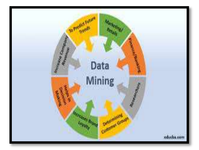
Figure 6: Data mining Benefits

Business intelligence tools helps to make proper chart or graphs of the business operation and display all the information shortly to understand the issues and also improve the skills of the business management. It helps to manage the decisions of finance of the business and also make decisions of target market and customer segmentation. BI tools also can detect fraud of the business and manage customer relations through analysing data of the business and decisions of the management team [18]. Needless to say, BI tools are too effective and essential for business enhancement and making creative and proper decisions for business growth.