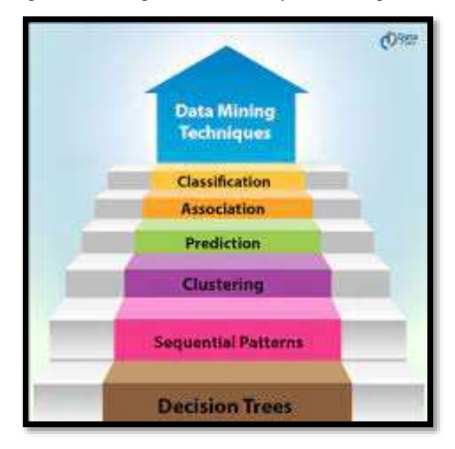
Figure 5: Data Mining Techniques

Business Intelligence, through data mining, make profitable production of the enterprise and adjust the operations of the organisation. Data mining discovers the relationship of one data with another and properly evaluated the information for the business management. Business Intelligence Tools provides understandable result and it also helps the business to increase the loyalty of customers towards the company [16]. Data mining helps the business to improve outreach of the business. Data mining has a major role in advertising and marketing policies of the business and it helps to make decisions for the marketing process. It helps the enterprise to reduce the repetitive mistakes and increase sustainability of the business. BI also helps the business to gain knowledge of environment of the marketplace and current situation of nature [17]. Through mining these kinds of data, the business can provide the help to the community and develop CSR strategy of the business.