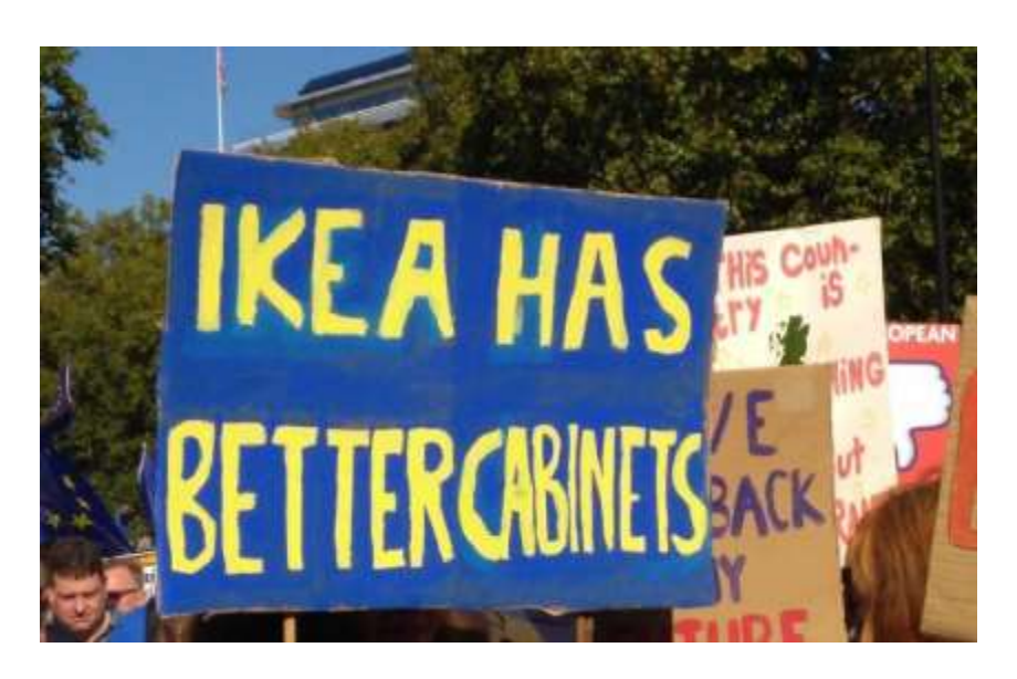
Figure 8. (Gerda, 2019)