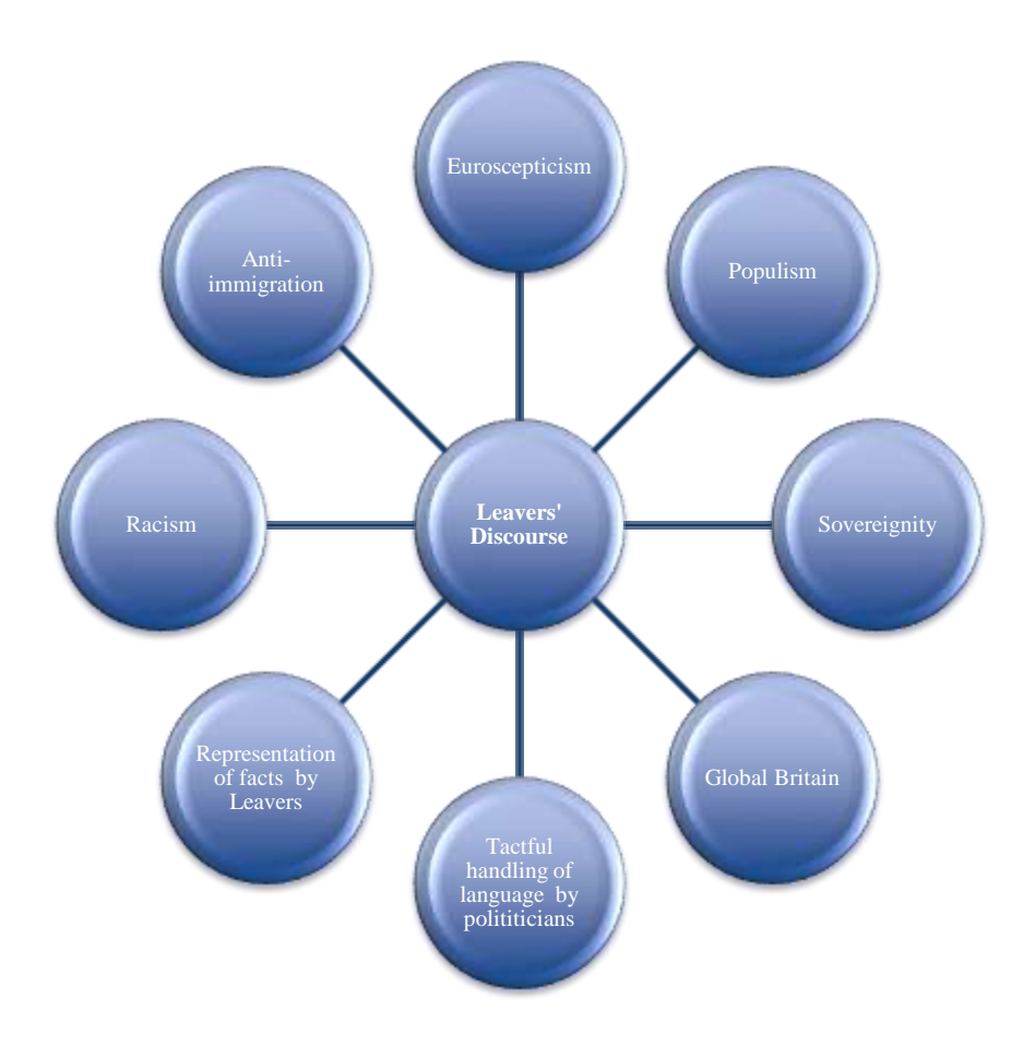
Figure 3. Figurative Representation of Main aspects of the Leavers' Discourse