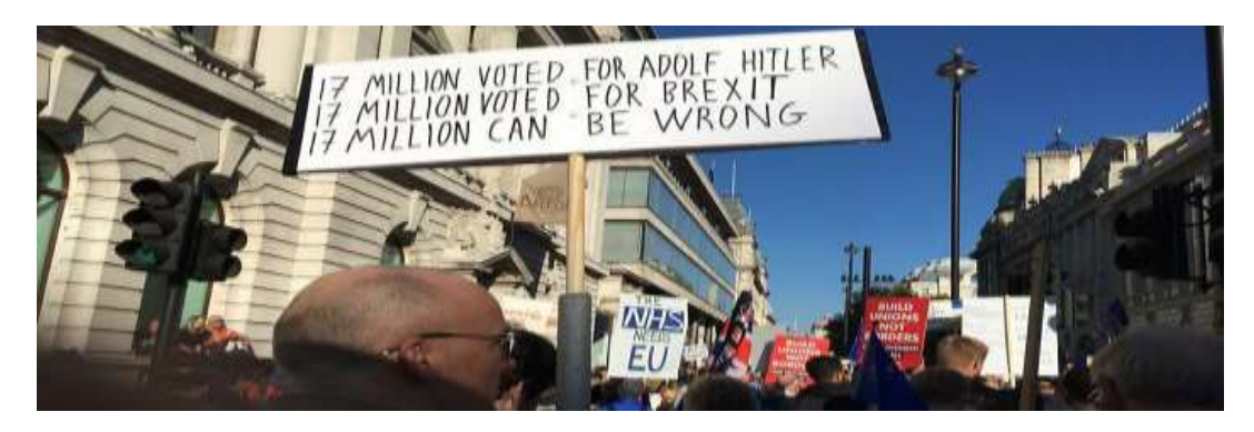
Figure 6. (Gerda, 2019)

recession and related gravity of the situation in a post-Brexit Britain led them to relate Brexit with economic genocide of the UK.