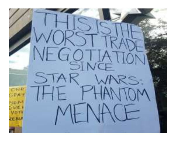
Figure 5. (Gerda, 2019)

The pro-EU protesters of the Remain campaign particularly expressed their opposing views regarding Brexit through various sorts of intertexts displayed on their placards. For example, the text on placard shown in Fig. 5 marks government trade negotiations as "WORST" and intertextually relates these to a film titled "Star Wars: THE PHANTOM MENACE" made in 1999. Here, these protesters are trying to demonstrate that the current government with a pro-Brexit stance is not competent enough to carry out successful trade negotiations with the EU as was the case with the protagonists of the film, i.e., Qui-Gon Jinn Obi-Wan Kenobi and Anakin.