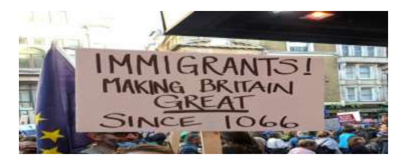
Figure 7. (Gerda, 2019)

In Fig. 7, reference to the year 1066 in history is made by the Remainers in relation to the immigrants indicating that just as after 1066, no nation has been able to invade England rather preferred seeking friendly relations with the UK, immigrants are no exception. They are not a crisis but a contribution towards making Britain Great.