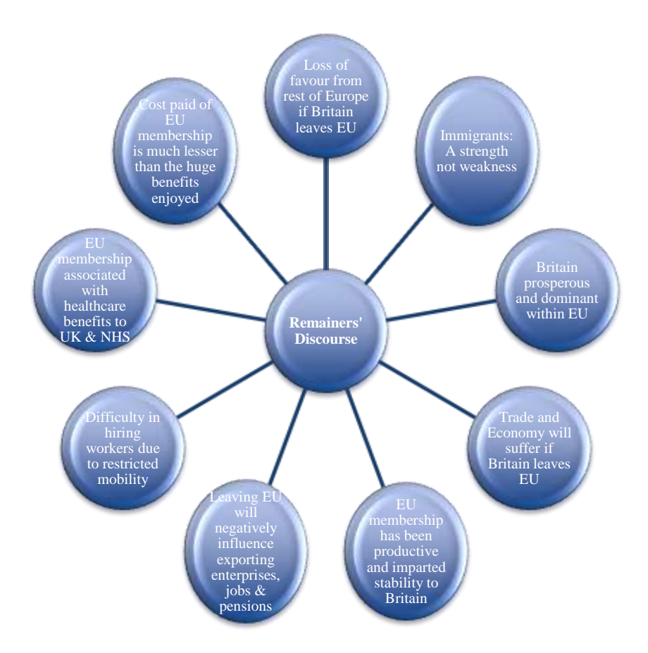
Figure 4. Figurative Representation of Main aspects of the Remainers' Discourse

Now, we will discuss briefly some main aspects of the above shown anti-Brexit arguments of Remainers as follows: