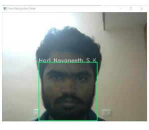
5 (b) Result when the object is closer