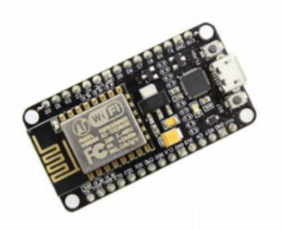
Figure 1. NodeMC ESP8266