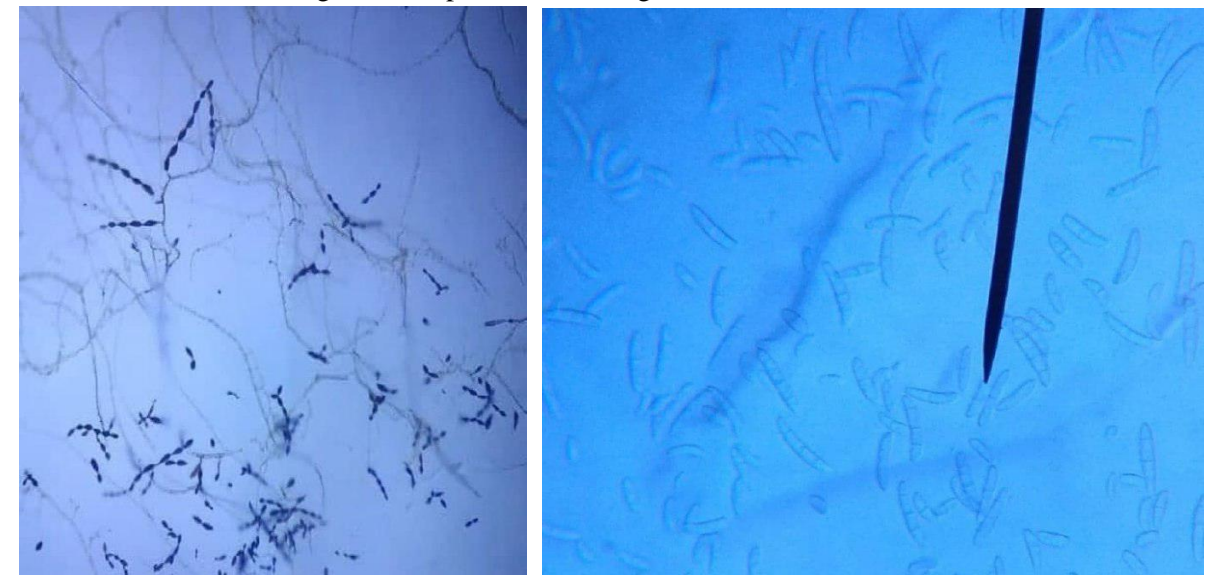
Figure 1. Alternaria spp and Fusarium spp isolated in tomato plant. macro and microconidia of fungi

Using the Visual Studio Code code editor, the Plant Quarantine Research Center's staff is conducting tests in HTML5, CSS, and Java on the main illnesses, spread, damage, and control measures of tomato plants. Research is being performed to establish a database for agricultural workers that includes strategies for predicting pests of vegetable crops as well as ways to conserve the environment for future usage. Illnesses of tomato and pepper crops cultivated in Tashkent region greenhouses were investigated in order to determine the sorts of diseases that affect vegetable crops and to investigate countermeasures.