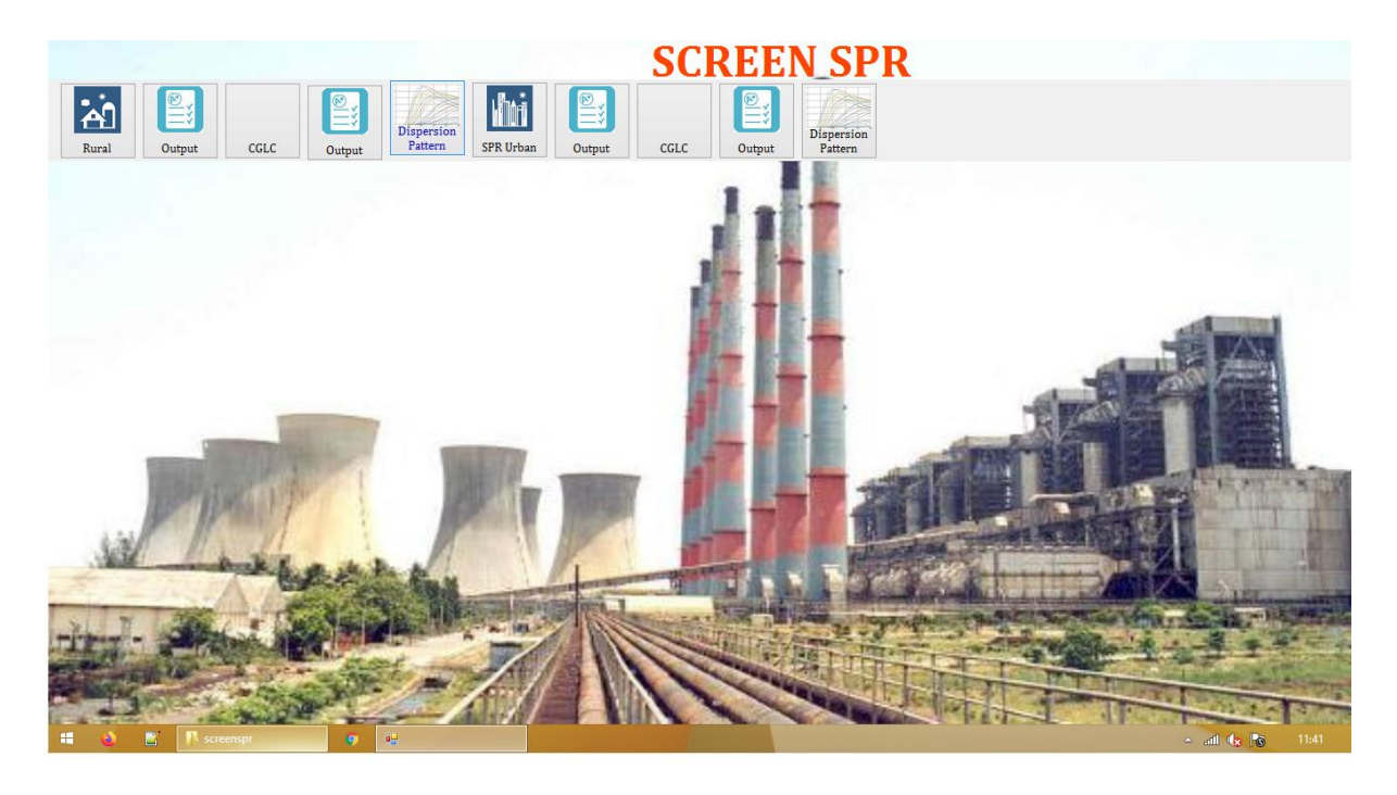
Figure-1: Main page of the SCREEN SPR model

The main page of the SCREEN SPR model is shown in the figure-1.