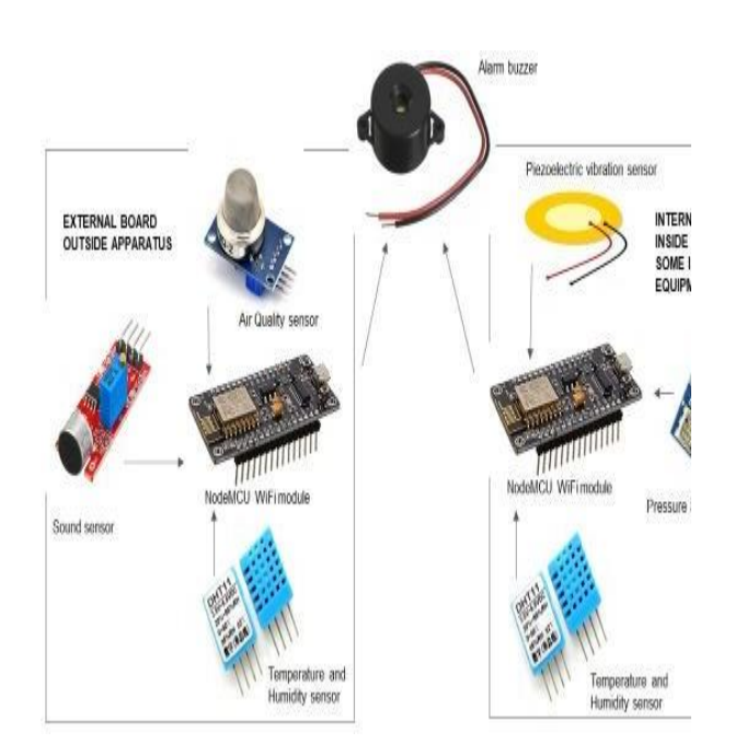
Implementation of sensors in External & Internal board