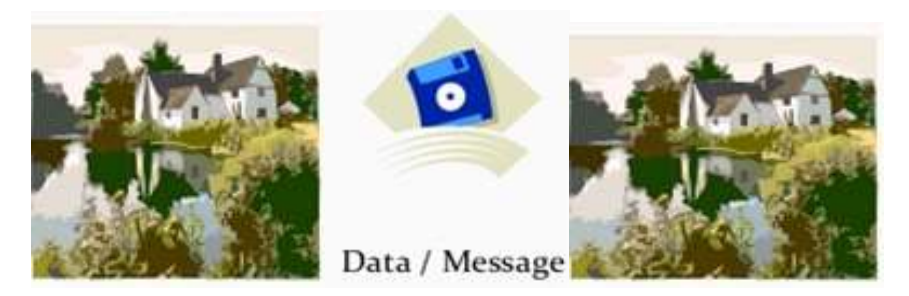
Figure – 2 Data embedding process

Data embedding process is shown in Figure 2. The data / message were hidden inside the image in a way that prevents the embedded user from accessing the hidden data / messages.