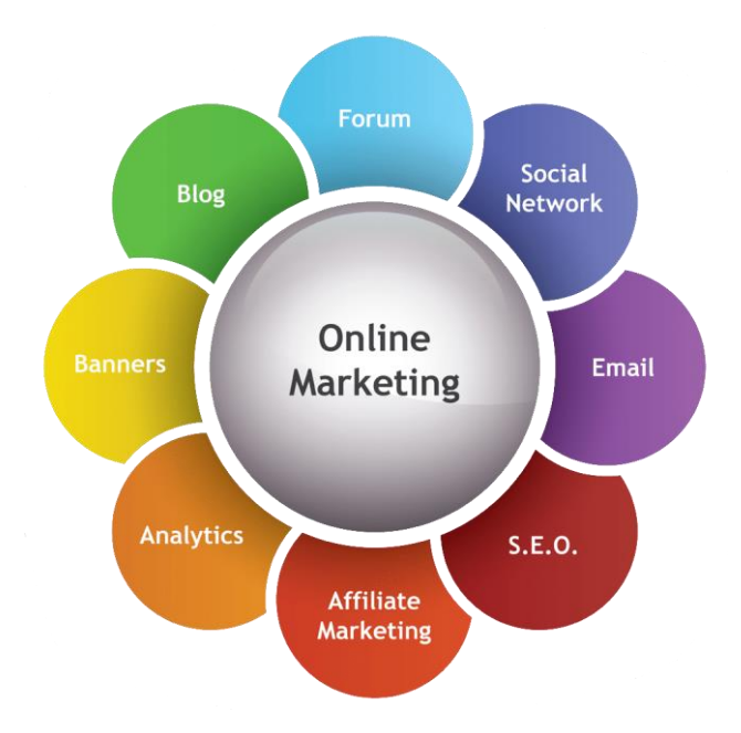
Figure 3. Online Marketing Forms

communicate with all companies of all sizes and from all over the world, and the ability to maintain interaction between clients and companies, especially in the hotel sector.