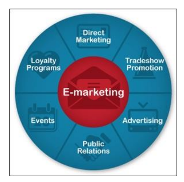
Figure 2. Electronic Marketing

Internet, extranet, intranet, and communication networks pre-provision of goods and services, with the aim of achieving customer satisfaction, and therefore all technologies must be used correctly, including design and production of goods and services, pricing of goods and services products, distribution, and promotion of goods and services, and improving the speed and quality of delivery processes Services.