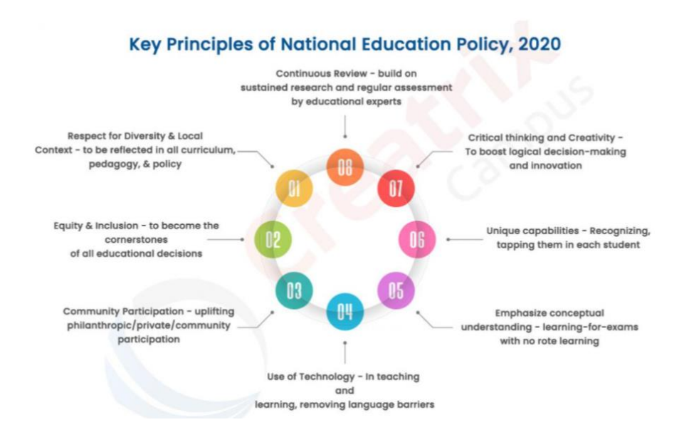
Figure: - Key Principles of National Education Policy - 2020

Imarticus Learning has launched an online BBA degree course in banking and finance with Bengaluru-based JAIN (Deemed-to-be University).