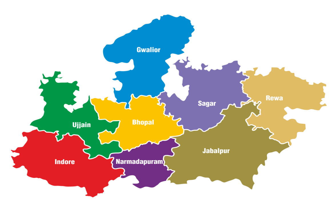
Fig. 1: Narmadapura Division of Madhya Pradesh

A research is conducted with the main purpose of contribution of something new and unique to the prevailing stock of knowledge in any field by developing a new concept or effecting advancement in the connotation of existing concepts. It can be properly accomplished through any study only through preplanned and well defined steps applying perfectly applicable methods in each steps there by facilitating the collection, analysis, and drawing conclusion smoothly and meaningfully. With a view to effectively carry out the study conceptually and methodologically structured research design is a must. [5-7]