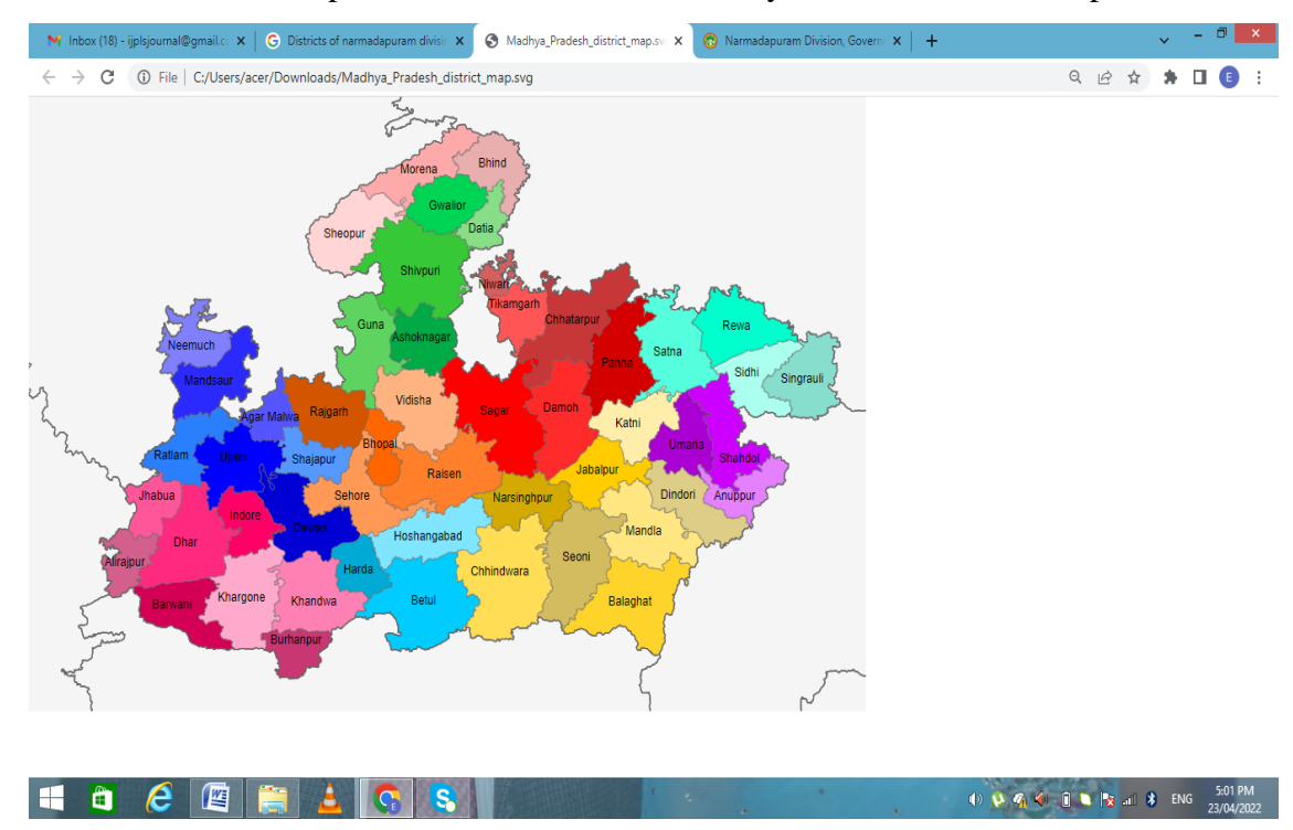
Fig. 2: Districts (Betul, Harda & Hoshangabad) of Narmadapura Division of Madhya Pradesh