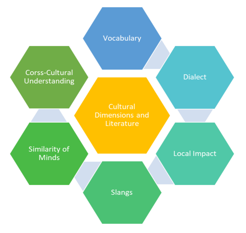
Figure 1 Cultural Dimensions and Literature

In conclusion, culture is important for learning the English language. Learners can gain English language proficiency more successfully if they are aware of the cultural variables that influence language usage and learning. Additionally, English language instructors who are sensitive to cultural variations can foster a more welcoming and accommodating learning atmosphere that values and respects all cultures. The capacity to communicate effectively across cultural boundaries is becoming more and more important as the globe gets more interconnected. English language learners who are culturally aware and competent will be better equipped to succeed in today's interconnected world. Figure 1 shows various dimensions of culture that affect the literature and writing.