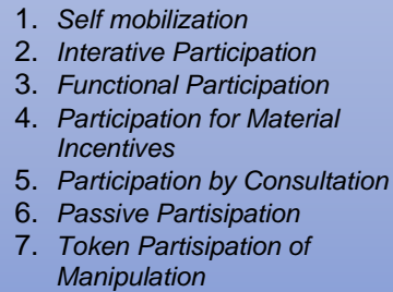
Figure 1. Recommended Models of Women's Participation in Development Planning in Jayapura Regency

Based on this figure, it explains that it is necessary to form an integrated Musrenbang Forum. This Integrated Musrenbang Forum consists of multi-stakeholders. All stakeholders are involved in an integrated Development Planning Conference (musrenbang) forum which is involved from the start of development planning starting from the Musrenbang at the village level, the Musrenbang at the district level to the Musrenbang at the district level. The involvement of women in this integrated Musrenbang Forum makes women have a position in every planning stage so that women can convey ideas in development planning. The active involvement of women in development planning needs to be supported by government programs, for example, the socialization of the need for women's involvement in development.