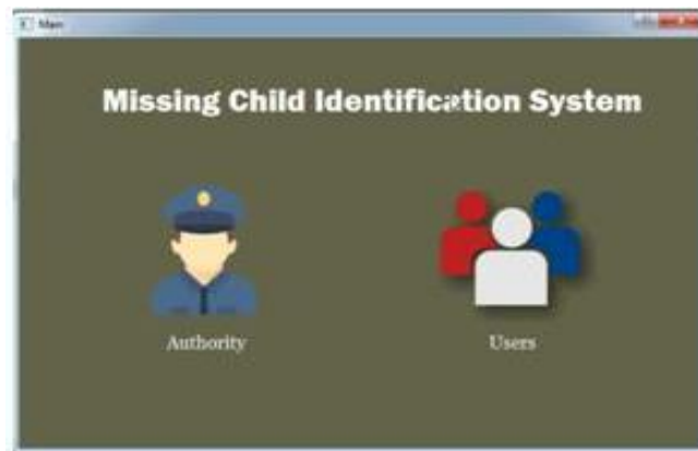
Fig: - 2 Home Screen