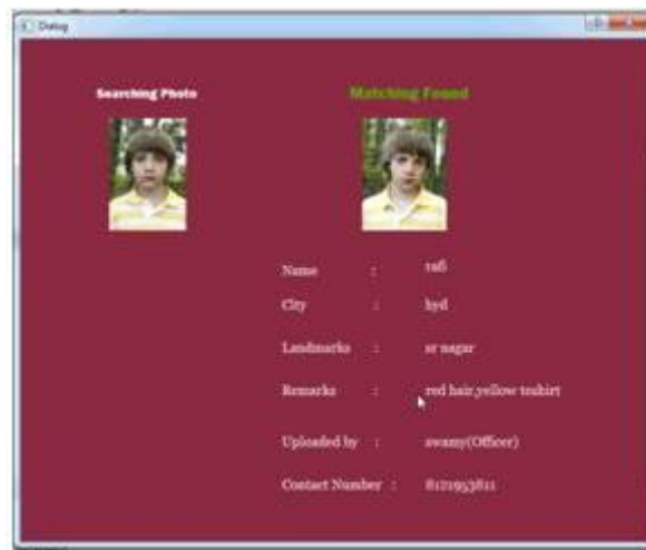
Fig:-5 Search Module Result