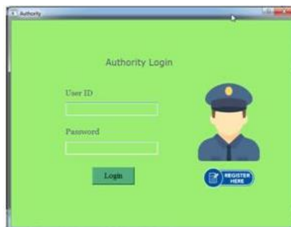
Fig:-3 Authority Login