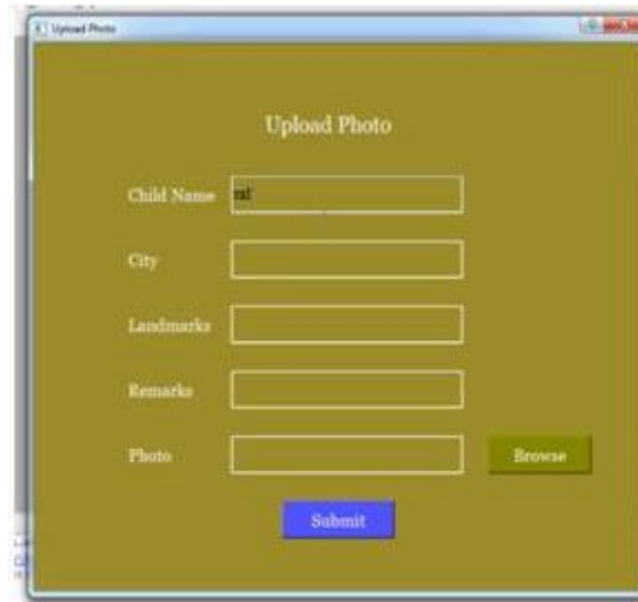
Fig:-4 Data Upload