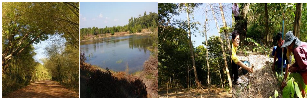
Figure 2. Natural resources in community forests and community network cooperation activities.