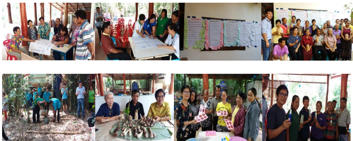
Figure 3. Picture of the meeting to create a plan to develop sustainable community forest use and pilot development projects Bamboo Mushroom Cultivation and Product Processing.