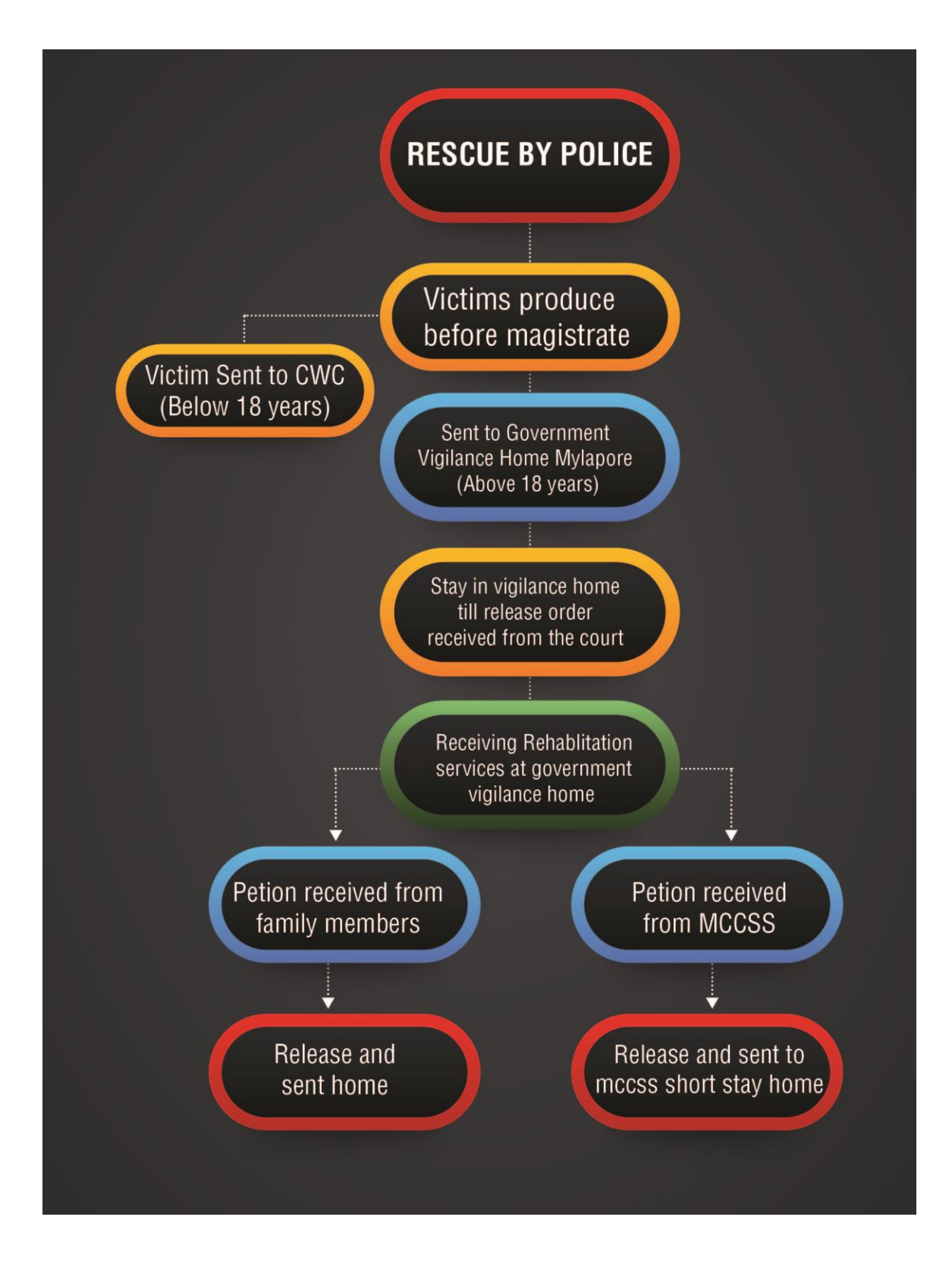
Case study - Vigilance Home:

Rehabilitation of survivors of sex trafficking victims in the vigilance home, Chennai- In-depth case study Analysis